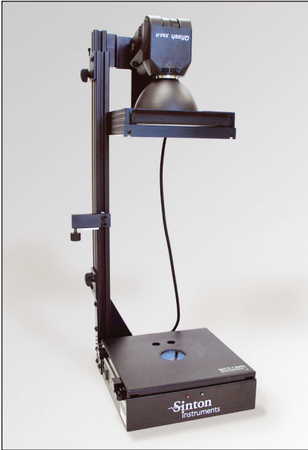
The WCT-120PL is an affordable, tabletop silicon lifetime and wafer metrology system.

Measure the calibrated carrier-recombination lifetime of a silicon wafer using both the standard method and the photoluminescence method.